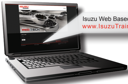
Isuzu Web Based Training www.IsuzuTraining.com

Contact your Distributor to get started today! For additional information, refer to the Isuzu Technical Training Bulletin TTB-03-14 from the Isuzu Information Library.